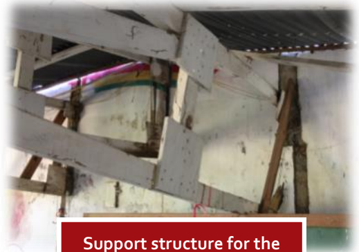
Support structure for the existing roof was failing.

During the week, the team also led two days of Bible School in the church, as well as two days of Bible School for the kids in the neighborhood of the mission house! The events in both locations were well attended, and the team had a fun time working with the kids!