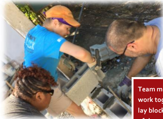
Team members work together to lay block for one of the walls.

The Least of These Ministries has a special connection to this church and its members, especially with its link to the formation of the ministry. Many teams have worshipped at the church, and many friendships have been formed there. With several new team members on this team, new friendships are being made. It is a privilege to serve Pastors and churches to support the important ministry work they are doing each day.