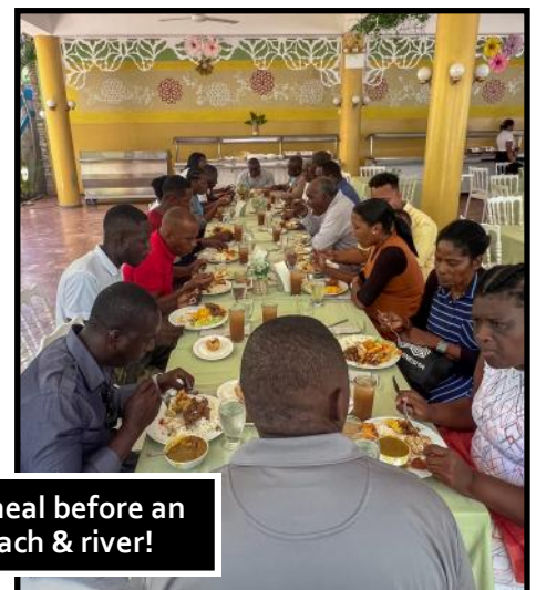
Participants enjoy a meal before an afternoon at the beach & river!

It is an honor and privilege to be able to encourage and uplift these men and women who are so dedicated and passionate about serving God in their communities. Please pray that they would continue to teach and minister with wisdom and peace!