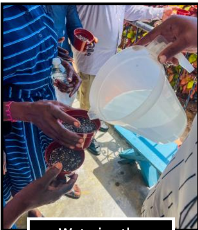
Watering the sunflower seeds!

After a morning of teaching, worship, and prayer, the group enjoyed lunch at a Barahona restaurant, followed by an afternoon at the beach and river.