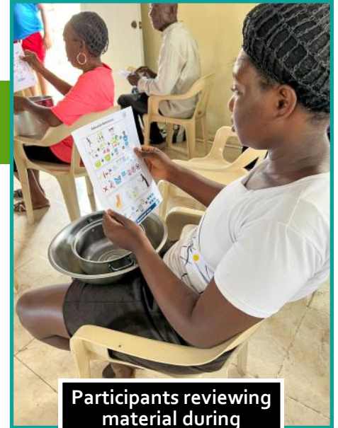
Participants reviewing material during seminar.

Feed My Starving Children (FMSC) provides the nutrition information pages, written in Spanish, to their partners for purposes such as these seminars. The one-page card presents graphic illustrations of proper handling and preparation of the food product, including the importance of using product before its expiration date. Ricardo recommended that attendees use older product left from an earlier distribution before using newly received packs.