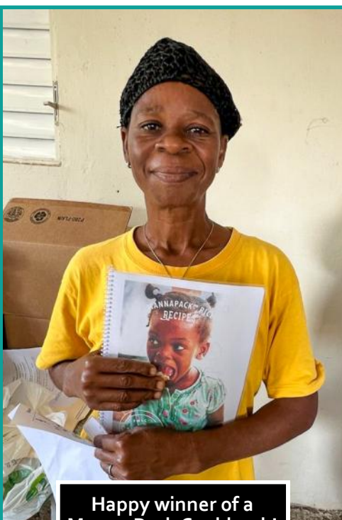
Happy winner of a Manna Pack Cookbook!

The value of eating a balanced diet is also presented in the talks. Suggestions are provided to include vegetables and proteins along with the Manna Pack product. The team awarded several of the participants with a Caribbean-themed cookbook for preparing the Manna Pack–Rice. The cookbook was developed by FMSC with input from a trained chef, and provides recipes for local favorites using the Manna Pack product in place of rice.