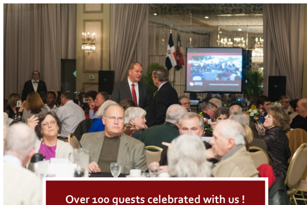
Over 100 guests celebrated with us !