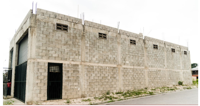
Our current warehouse; re-bar extending above the roof line was left to tie-in to 2nd-level construction.

We continue to give thanks and glory to God for enabling the purchase of the property and construction of the building entirely with the financial backing of our supporters—no loans, no debt!