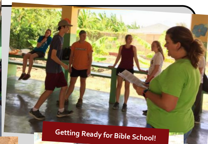
Getting Ready for Bible School!