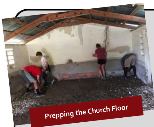
Prepping the Church Floor