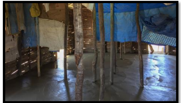
Neighbors installed the new roof on the Pastor's house

floors in six homes that previously had dirt floors.