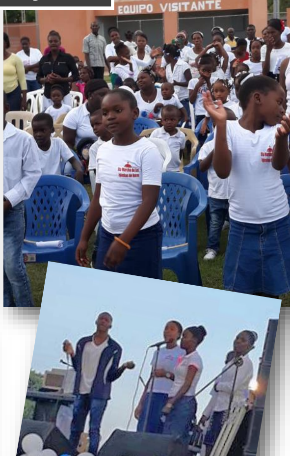
Young adults from the community sang with the worship band.

Hear, O Israel: The Lord our God, the Lord is one. Love the Lord your God with all your heart and with all your soul and with all your strength. These commandments that I give you today are to be on your hearts. Impress them on your children. Talk about them when you sit at home and when you walk along the road, when you lie down and when you get up.