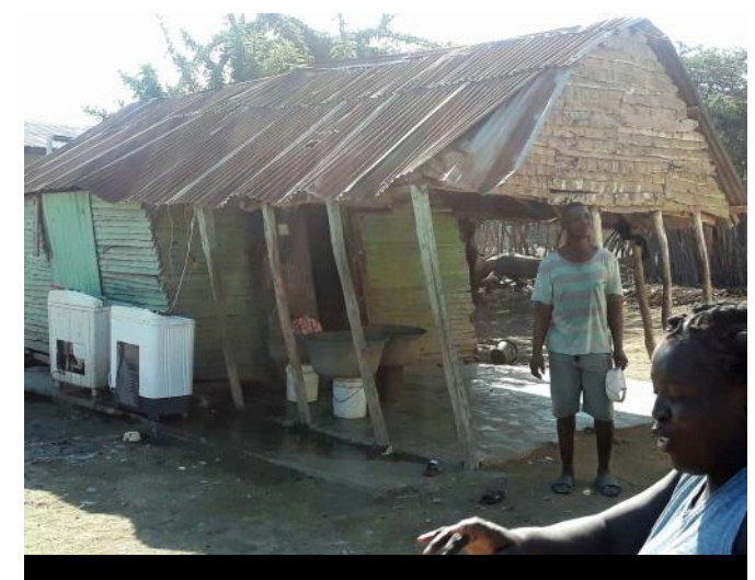
The original house was in serious disrepair.