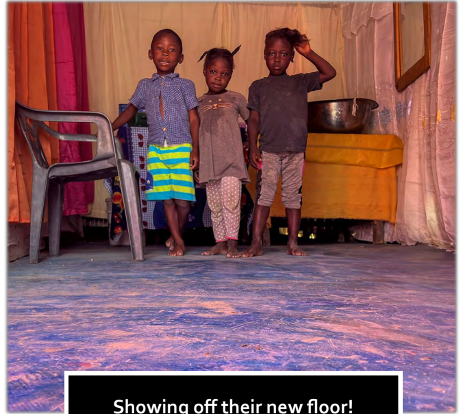
Showing off their new floor!

Early this year, the Club provided a gift of $10,000, specifically to help us address the long-standing need for concrete flooring in homes where we serve. Many of you know of this need either from personal experience on a mission team or from past articles or conversations. In fact, concrete floors have been a common mission team service project for several years.