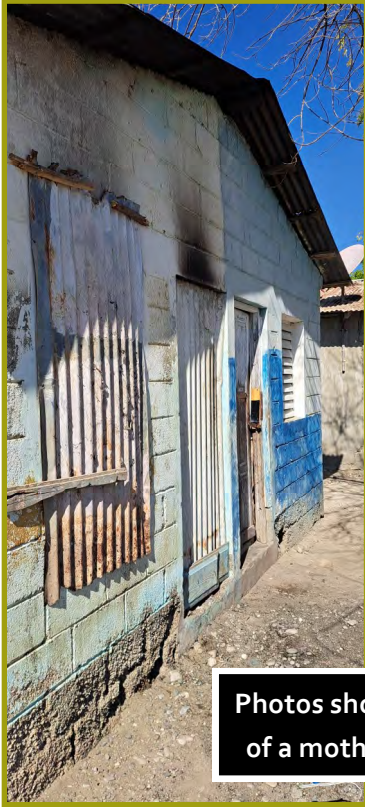
Photos showing the home, gutted by fire, of a mother and her five young children.